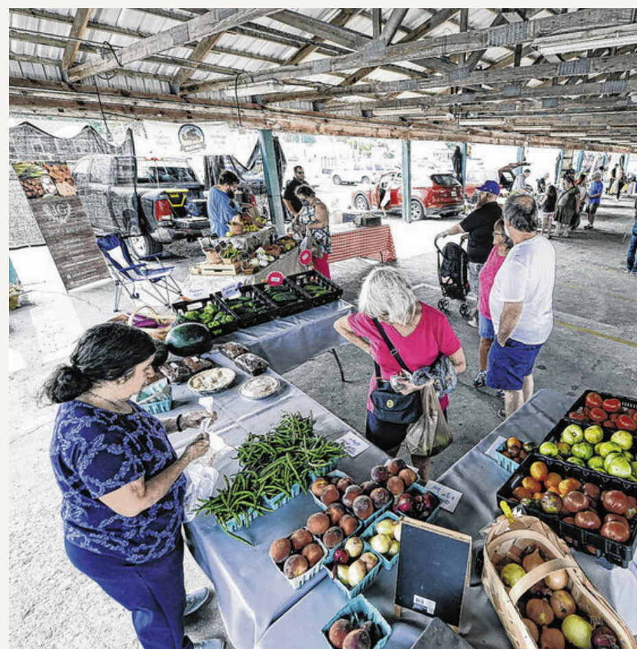
Photo of the Greenfield Farmer's Market

In the town of Greenfield, Indiana, a market is held at the Hancock County Fairgrounds, located at 620 N. Apple Street. The primary purpose of the market is to provide consumers with an opportunity to purchase fresh, locally grown produce, meat, dairy products, and other food items from local producers. Year-round Farmers Market - local meats, produce, baked goods, and much more. The market is open Saturdays from 8 am to Noon from May to October. The winter market starts in November and runs through April, on the 1st and 3rd Saturdays of the month, from 10 am to 1 pm.