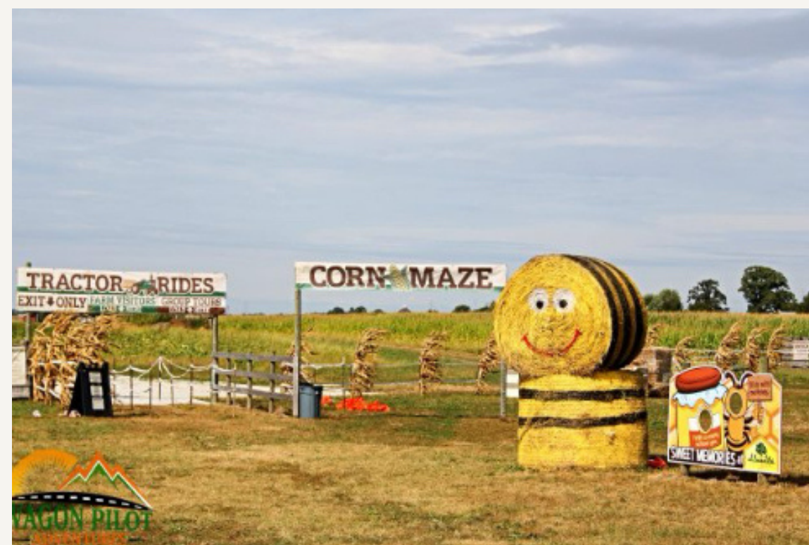
Tuttle's famous corn maze and tractor rides are here for visitors to enjoy this fall.

Whether you're picking apples at Tuttles or riding the train at Lark Ranch, both destinations offer a perfect way to make memories and celebrate the beauty of the fall season.