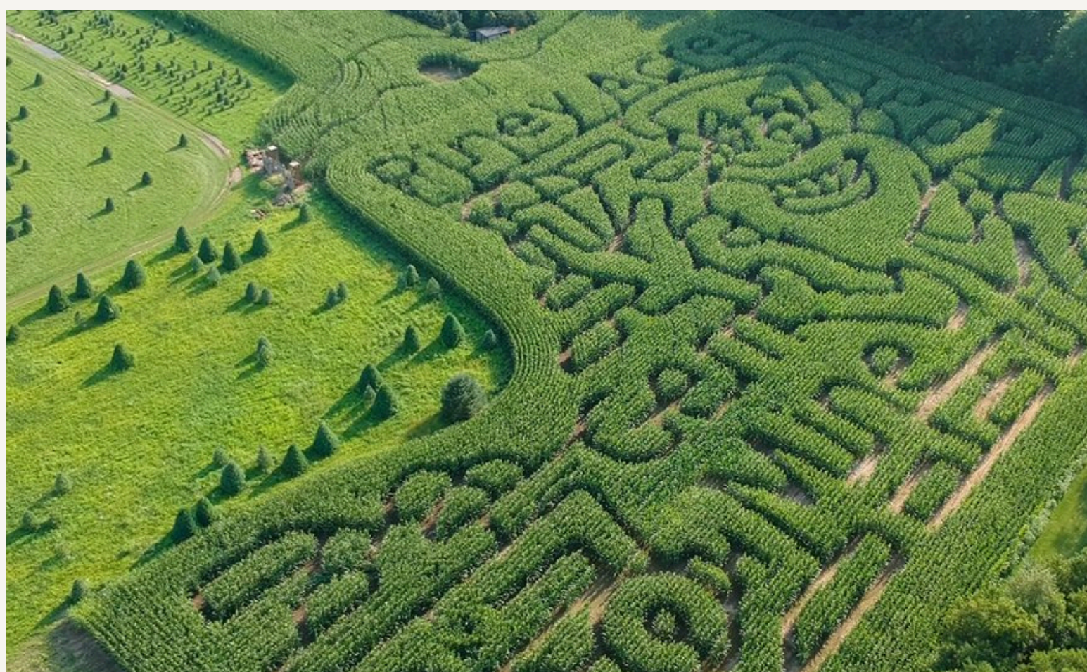
Piney Acres popular corn maze and tree farm

So if you and your friends are looking for an amazing way to spend a crisp autumn day, Piney Acres is the place to go.