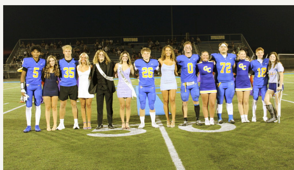
2025 Homecoming Court