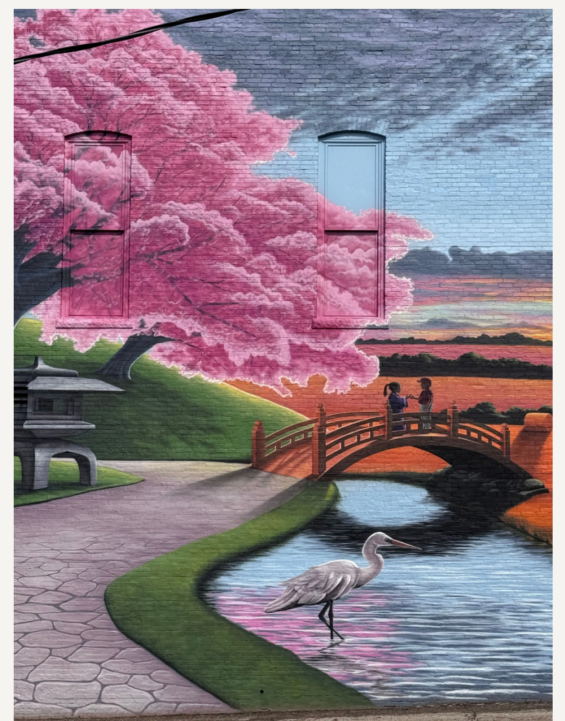
Sister City Mural done by Carl Leck

The main point in this mural is the boy and girl who meet on the bridge. The boy dressed in overalls, and the girl in a dress are shaking hands. This mural represents the difference between cities, but the connection we make with the Sister Cities program.