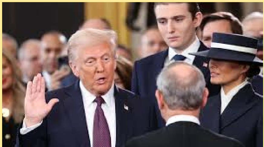
Chief Justice John Roberts swears in Donald Trump as the 47th President of the United States.

The president concluded his speech with his proclamation to, “Make America Great Again.” While the full impact of President Trump’s promises remains to be seen, his inauguration will undoubtedly be remembered as a pivotal moment in American history. Whether it fulfills its promise of a golden age or deepens the nation’s divisions will depend on how these bold visions are translated into action in the years ahead.