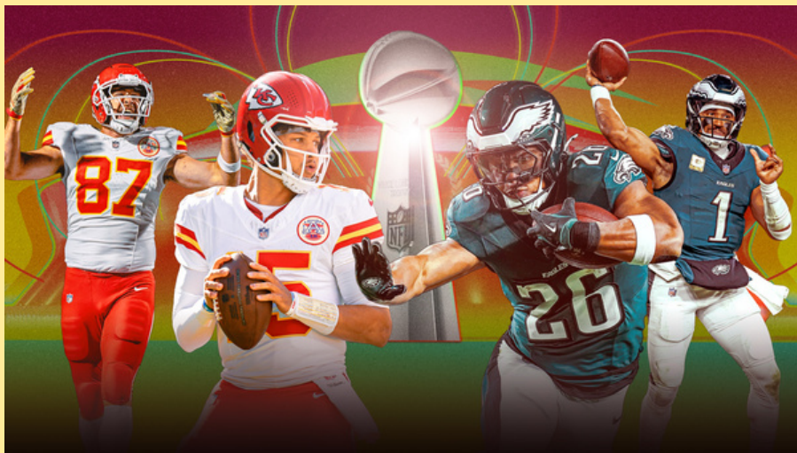
ESPN's Super Bowl LIX graphic.

The Chiefs and their quarterback, Patrick Mahomes, will face the opposing Eagles and quarterback Jalen Hurts. According to U.S.A Today, the betting predictions put the Eagles at a +180 chance to win and the Chiefs at a +200, meaning the Eagles are predicted to claim victory over the Chiefs.