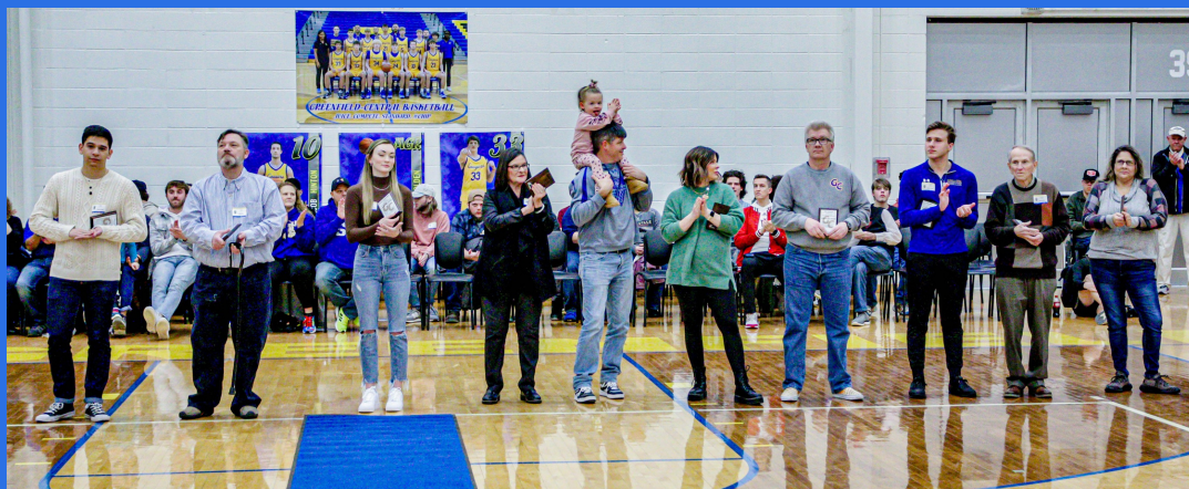
Hall of Fame Inductees lined up after receiving their award

Each individual mentioned is truly deserving of this recognition, as evidenced by their remarkable achievements. They have exemplified outstanding character and leadership, setting a positive example for the community. Congratulations to all on your impressive accomplishments!