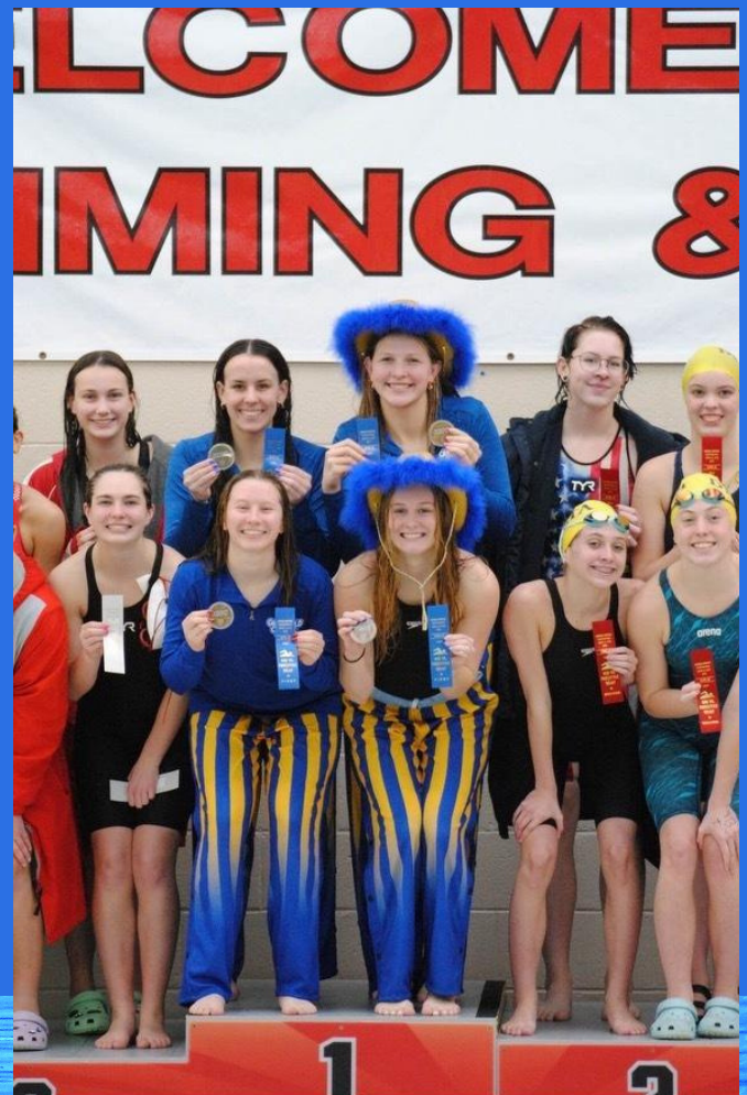
GCHS Women's Swim Team on the podium after winning the HHC meet.

We wish the team the best of luck as they strive for excellence in the upcoming meets!